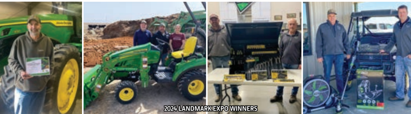
2024 LANDMARK EXPO WINNERS

▲ The above locations are hosting EXPO events at their location, however specials and discounts are available at all locations throughout the month of December.